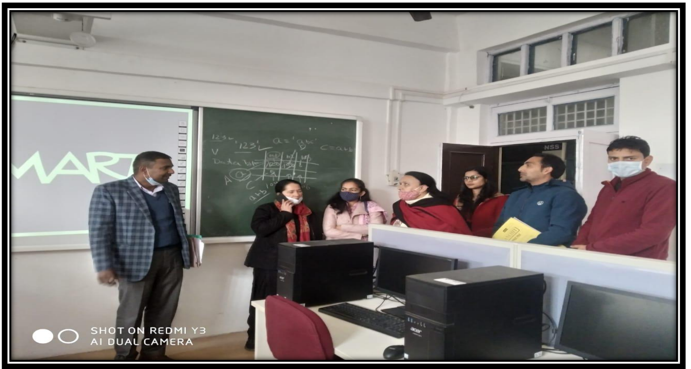
Visit to Information Technology Lab.