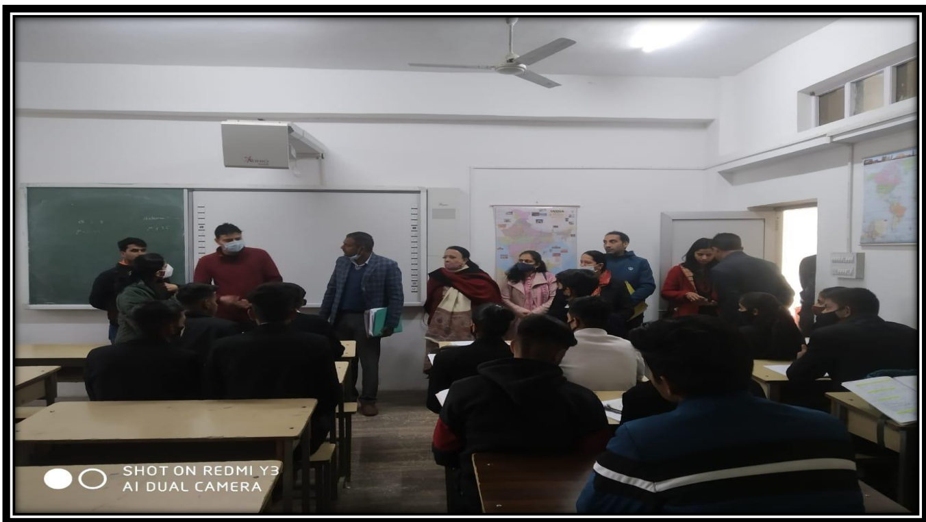
Visit to Hospitality & Tourism Lab.