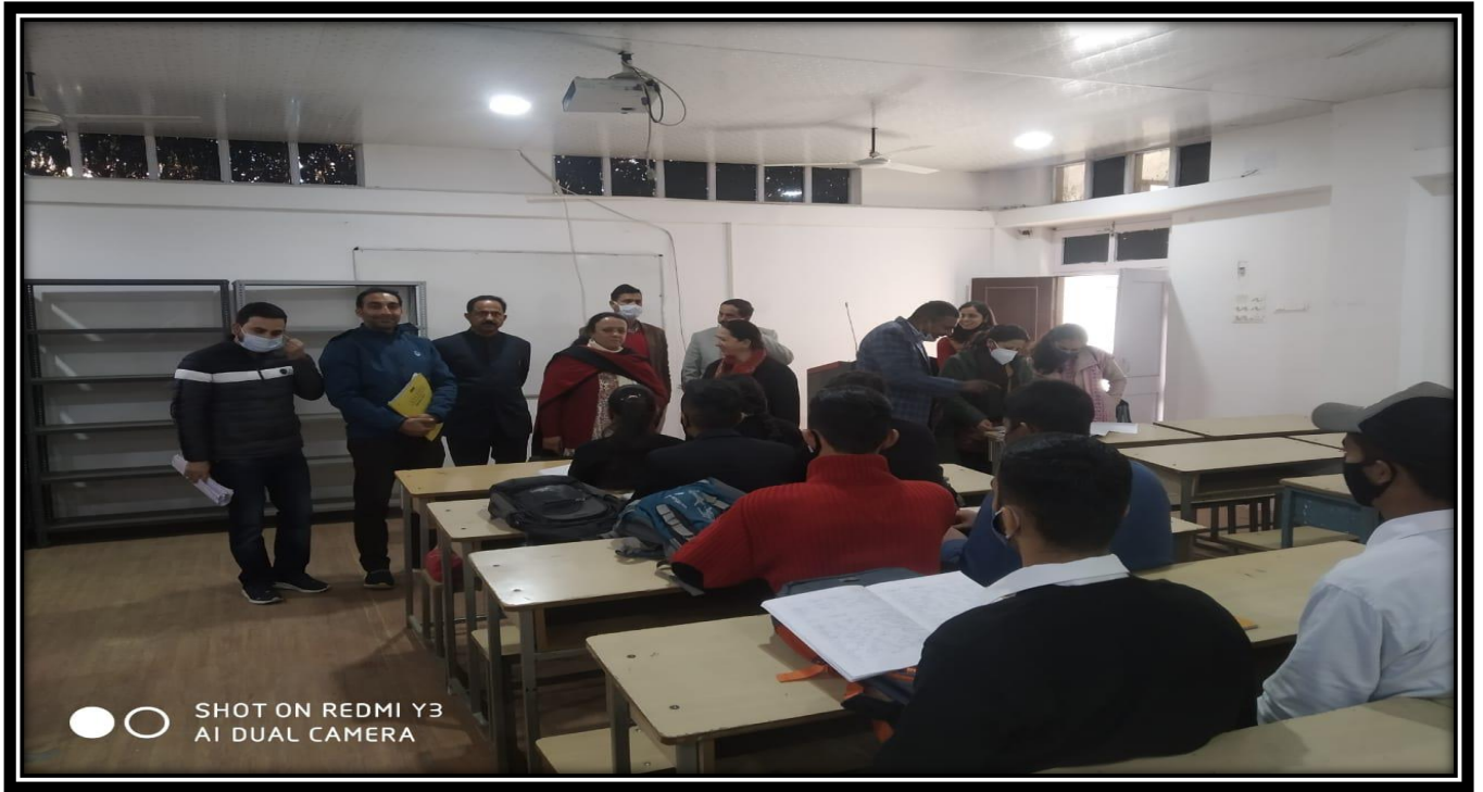
Visit to Retail Management Lab.